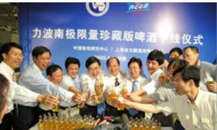
Celebrating the milestone.

support to the China National Antarctic Research Expedition to demonstrate its commitment to promote care for the environment and to enable the Chinese community to better themselves in the fields of research and science. This year, the Official Beer of the 21st China National Antarctic Research Expedition saw the team completing 27 research projects, including an Inland Antarctic Traverse to the Ice Sheet Summit as well as Dome-A, an ecological environment and biodiversity researches in the Southern Ocean.