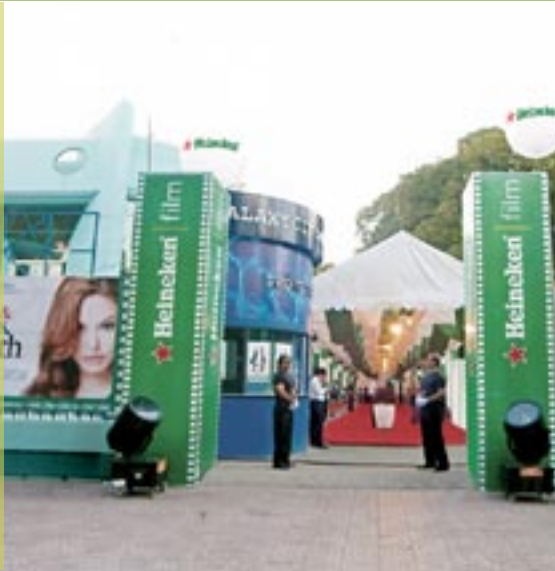
○ The Galaxy cinema was decked-up to the occasion.