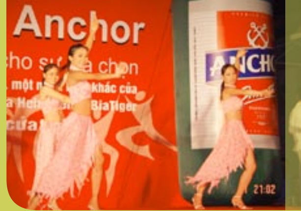
Anchor advocates fun this summer.

The Dutch Windmill, London Bridge Tower, Paris' Arc de Triumph - these world-renowned landmarks together with several other world attractions came to the heart of Hanoi as part of the Heineken Landmark Campaign that was held from 18 th July to 20 th September 2005.