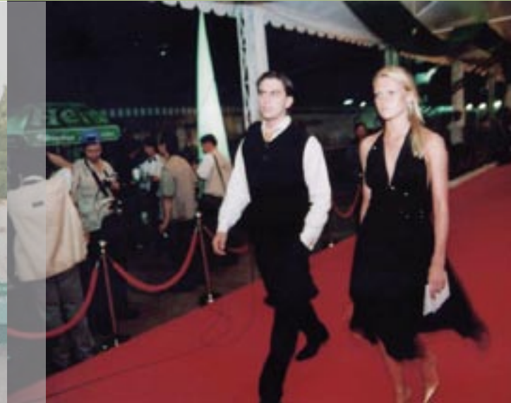
○ The movie premiere was well attended by over 800 invited guests.