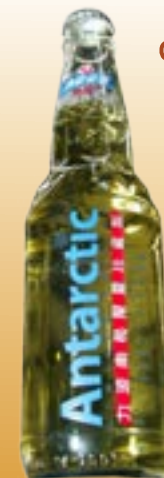
20,000 bottles of REEB Antarctic Limited Edition beer were brewed by SAPB.