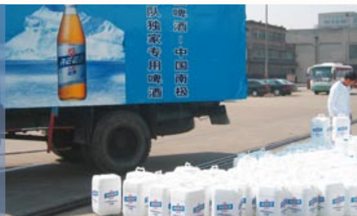
Two tons of ice were used for the brew.