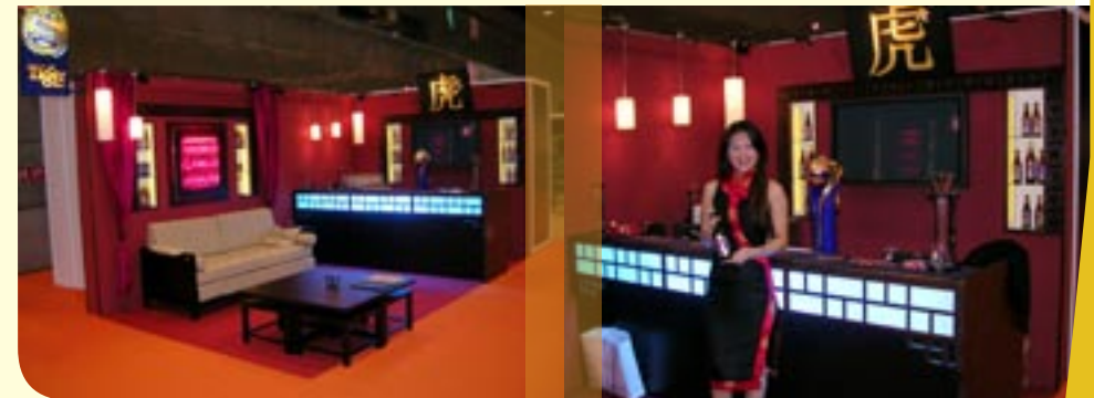
○ Tiger Beer's booth at TFWA.