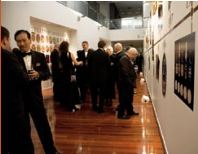
○ Guests mingling in the gallery and absorbing DB's history.