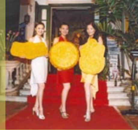
Tiger Beer's summer campaign offers gold labels and caps as prizes.

Not only has the three-month campaign significantly boosted the selected modern off-trade and on-trade demand where the campaign was organised, the marketing effort has reinforced Heineken's image as a truly international beer brand.